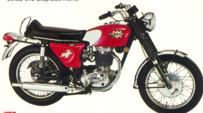
BSA SHOOTING STAR 441 441cc Alloy Single

This is the super sport tuned for performance. This is the one described as the "fastest street machine under 750cc". This limited-edition bike has racing parts and the new double leading shoe racing front brake and has been timed at an actual 120 mph, but canters along at top legal speeds like a well-mannered thoroughbred.