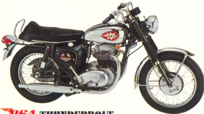
BSA THUNDERBOLT 650cc (40 cu. in.) Twin

Great for the roughest trails. And underneath the glossy beauty there is ruggedness to spare. Oversized racing brakes, rugged shock absorbers measure up to the engine thrust.