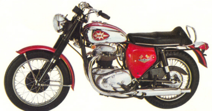
BSA ROYAL STAR 500cc (30.5 cu. in.) Twin

Big engine, small rev-count per mile, smoothest cruising performance and flashing new chrome fenders. The Thunderbolt is the one with the tamed thunder.