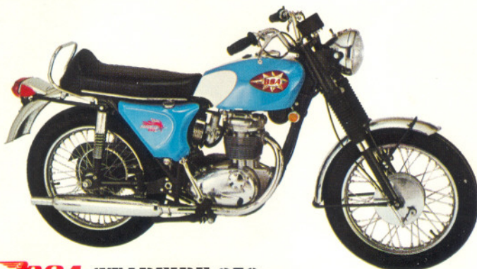
BSA STARFIRE 250 250cc (15 cu. in.) Single

All the power you'll ever need to flatten the steepest hills, even with two up. Easy starting, easy riding, easy to look at and the lowest priced, full sized Twin in the line.